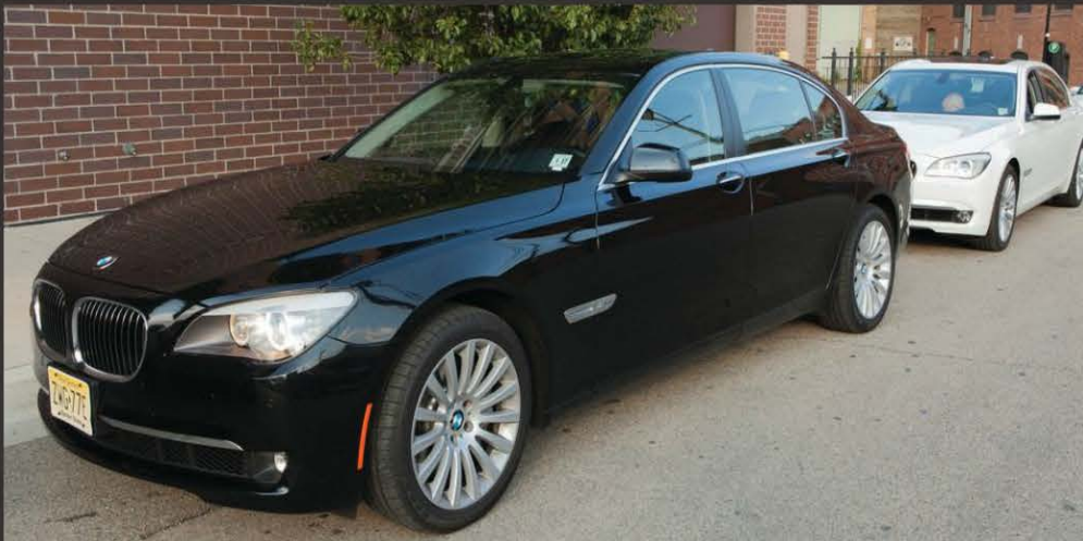
The brand new BMW Series 7 picked up guests and drove them to the Director's private home for the Embeya dinner