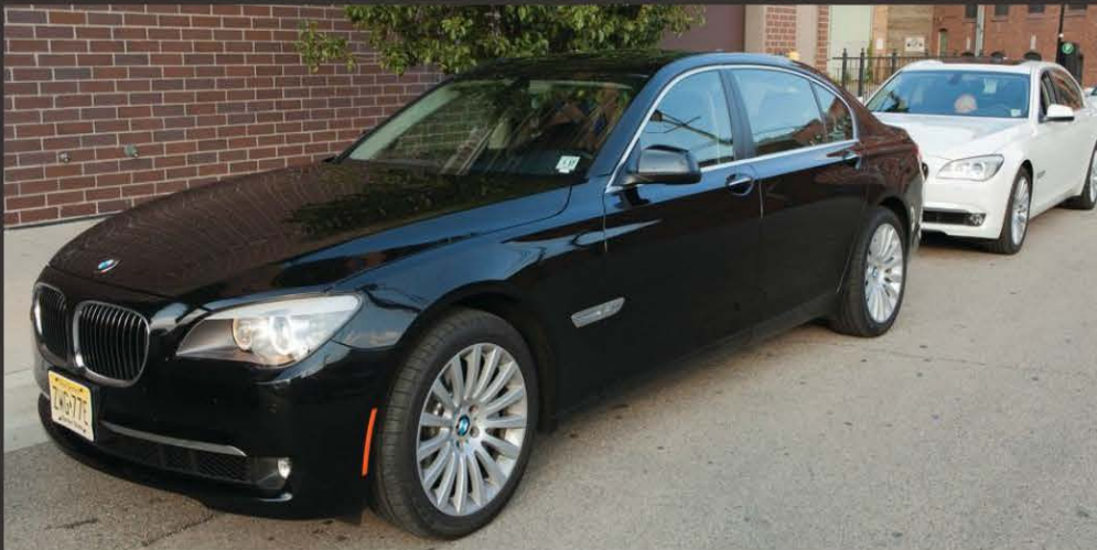
The brand new BMW Series 7 picked up guests and drove them to the Director's private home for the Embeya dinner