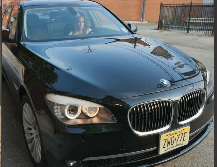
BMW Series 7