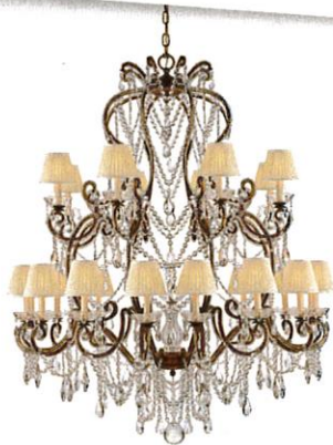
Ralph Lauren Home's "Adrianna" chandelier in gilded iron, $12,000 (ralphlaurenhome.com)