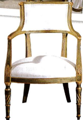
Niermann Weeks's "Campanella" highback armchair, trade only (niermannweeks.com)