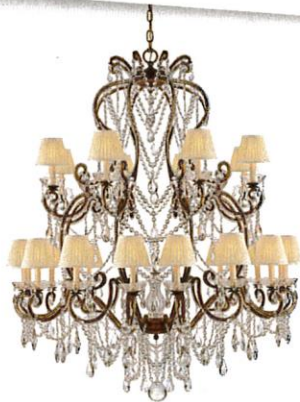
Ralph Lauren Home's "Adrianna" chandelier in gilded iron, $12,000 (ralphlaurenhome.com)